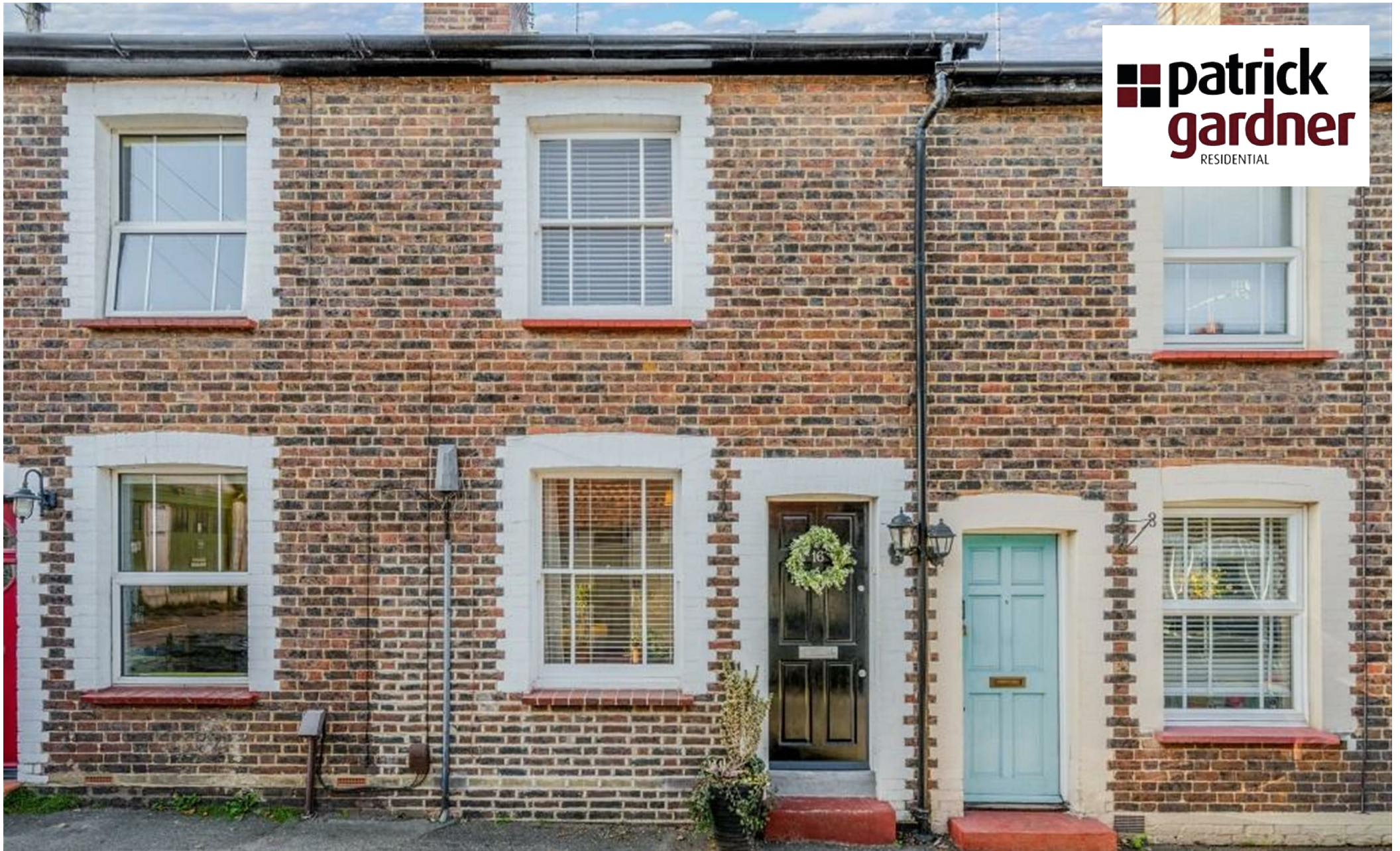
16 Hart Gardens, Dorking, Surrey, RH4 1JT